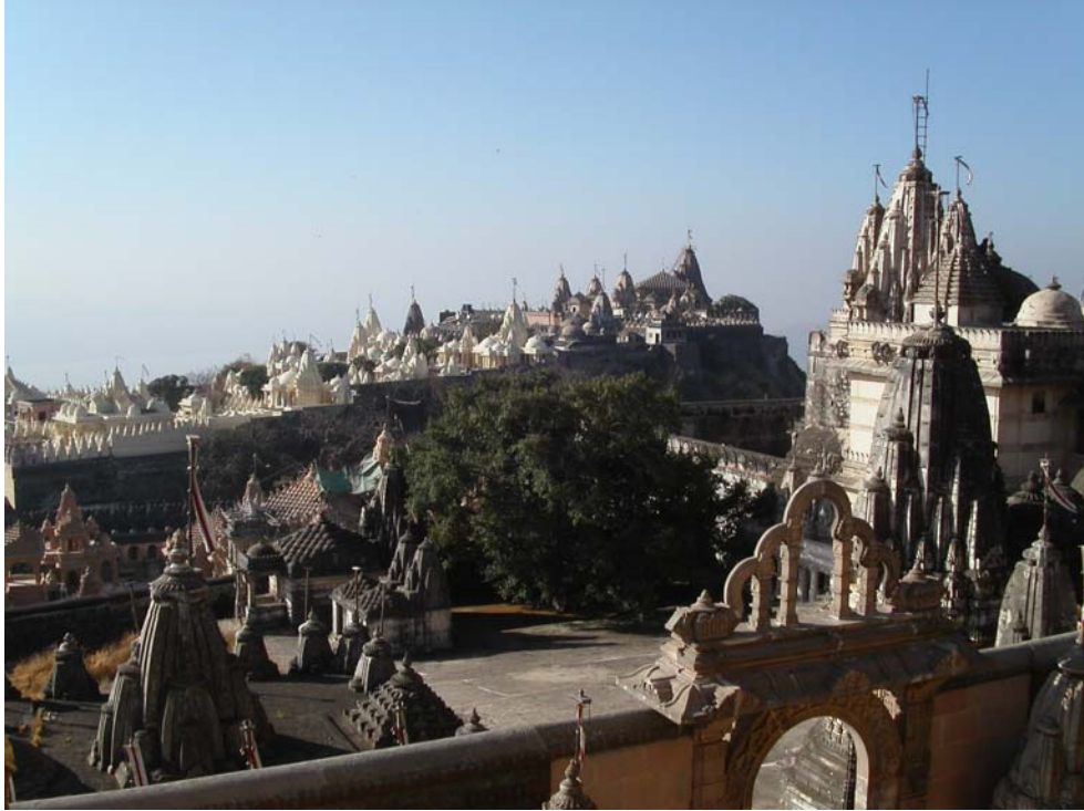
Plate 1. General View of Śatruñjaya, with main Ādīśvara Temple in the background