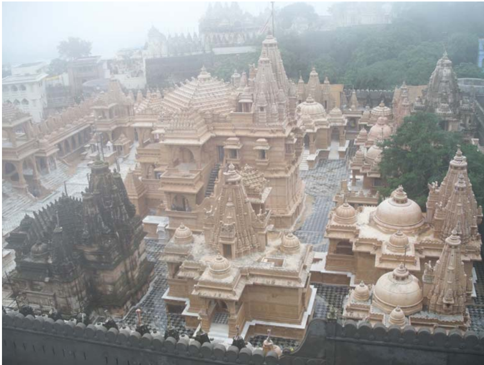
Plate 2. Motīśāh's Ṭuṃk, from the northern summit