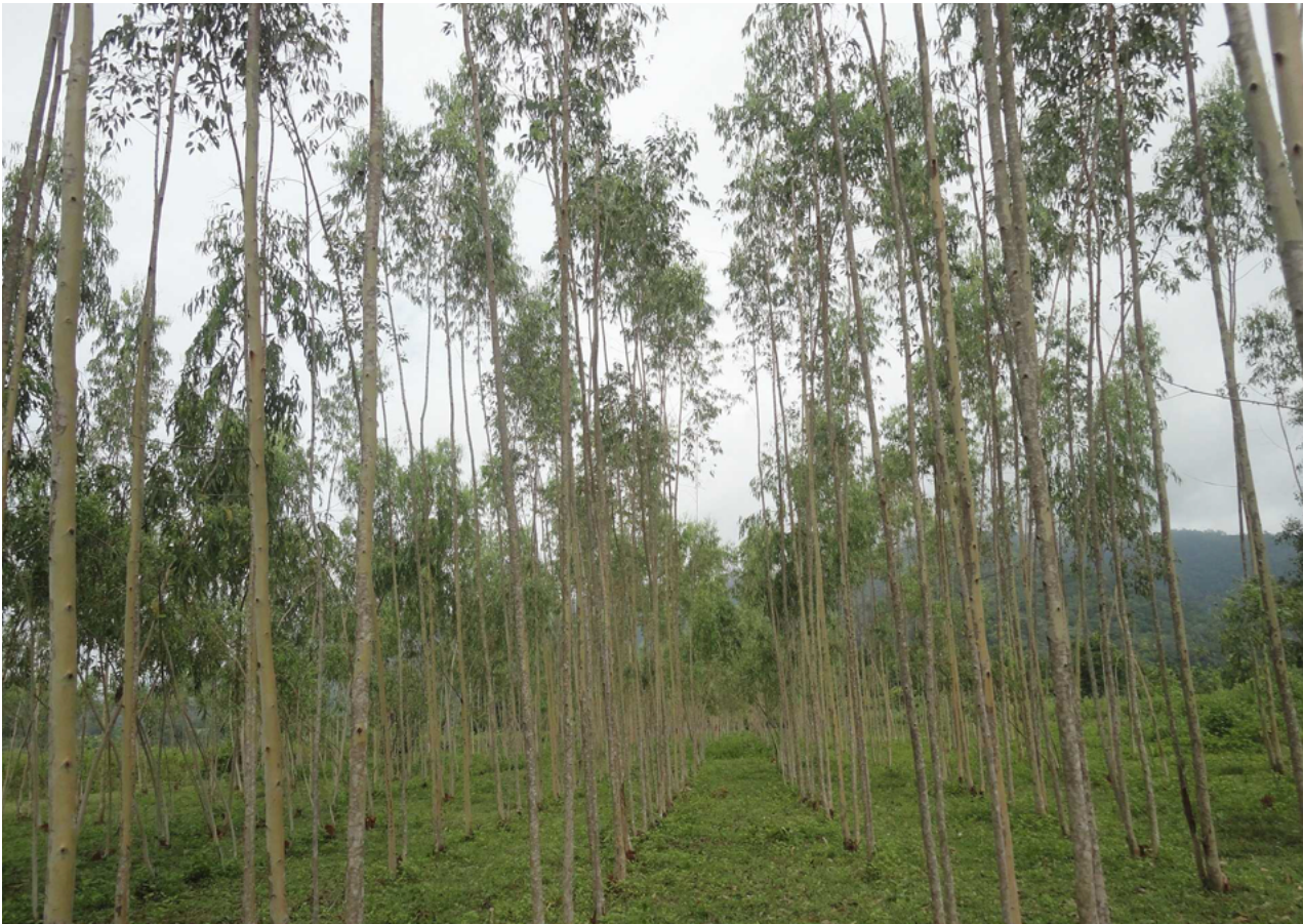
Clean Development Mechanism (CDM) supported monocultures typically involve local communities and are challenging to implement. Experience with a CDM forestry project in India has shown that farmers bear the financial risk in cases where revenues from carbon credits do not materialise.