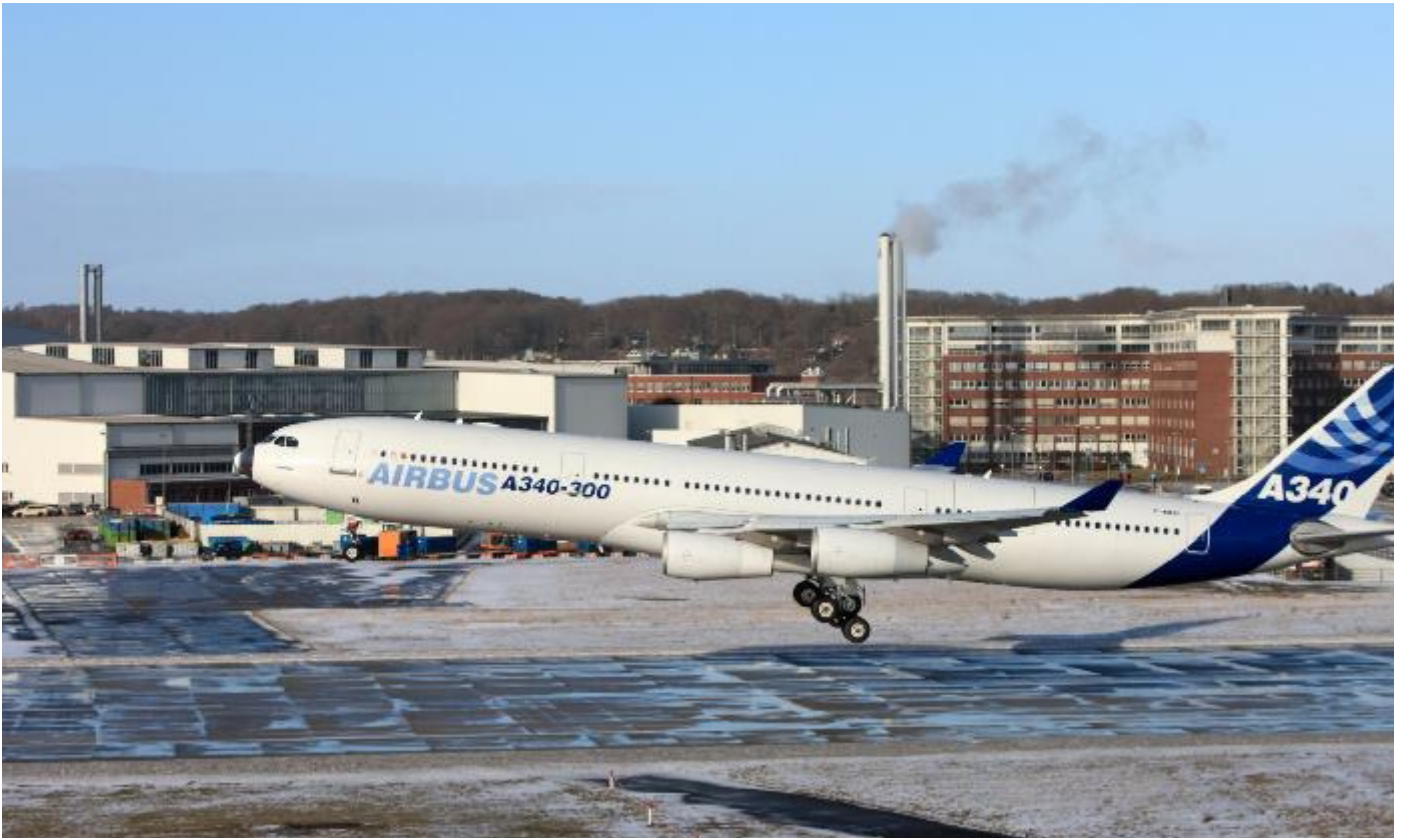
The EU decided that all flights arriving to and flying from the EU would have to account for their emissions