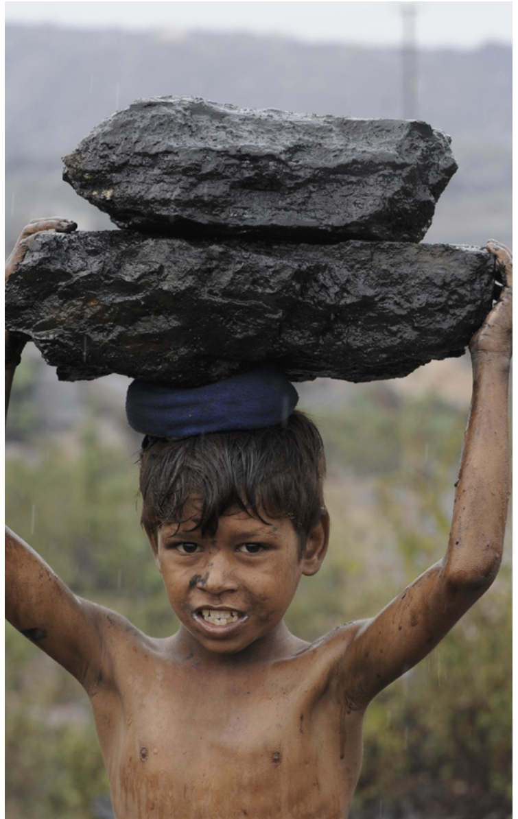
The CDM allows new coal plants to earn carbon credits for claimed improvements in power plant efficiency. However, coal projects do not belong in the CDM, because they conflict with the CDM's sustainability objectives by inflicting toxic burdens on local populations and ecosystems, they undermine climate mitigation goals by locking in billions of tons of CO 2 emissions over decades to come, and they would have been built in the absence of the CDM and hence do not generate carbon credits that represent real emissions reductions. This image shows a young boy in India collecting coal.

It is still unclear what types of offset credits would be approved for compliance under an avi-