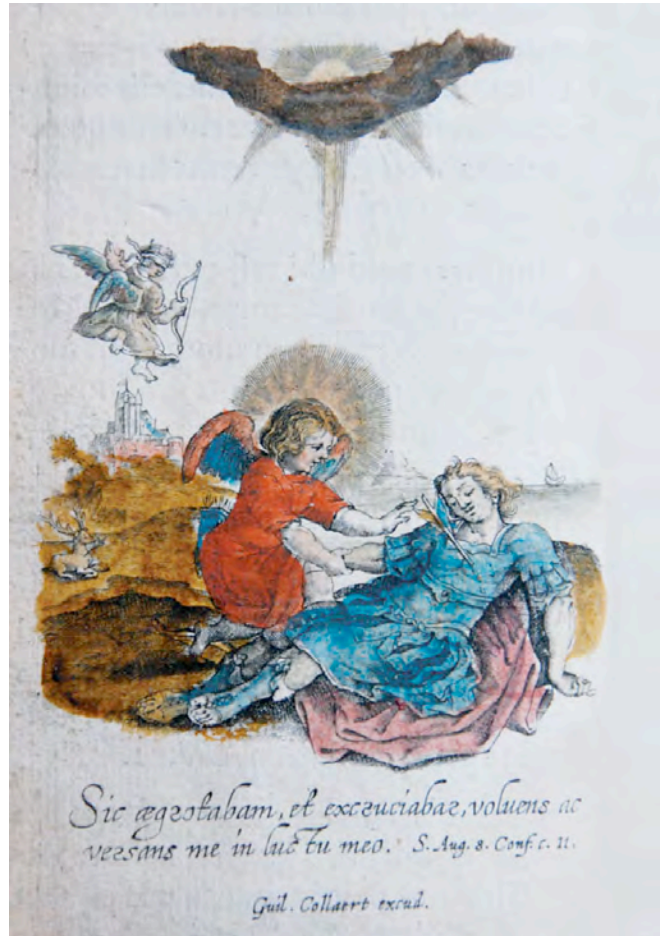
Figure 2. Guillaume Collaert (c. 1610-66), picture ("I was sick and tormented, twisting and turning in my chain" [ Confessions , Book 8, chapter 11]) of Emblem V, in Michel Hoyer, O.E.S.A., Flammulae amoris S. P. Augustini versibus et iconibus exornatae . . . (Antwerp, 1629).

[22] Francis's word-picture of the "reverberation" (1892-1964: 6:363; 2000: 119) that Mary's virtues made upon Joseph might itself be regarded as a symbolic exegesis of the extraordinary word-picture Francis draws of the privileged relationship that commences between Jesus in Mary's womb and Joseph in route to the house of Elizabeth and Zechariah. More than four decades later, Gambart gives Francis's verbal image graphic expression in an emblem designed to depict symbolically Francis himself, who was a living image of Christ who was the image of the invisible God.