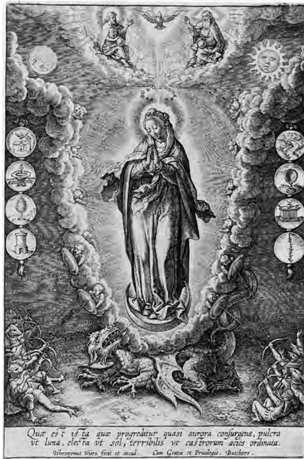
Figure 1. Hieronymus Wierix (c. 1553-1619), The Virgin of the Immaculate Conception (detail), engraving, late 16 th century. Mary’s attribute of the speculum sine macula (mirror without blemish) is to the right, in the second medallion. Wierix’s rendering of the Immaculate Conception has an almost comic-booklike character: the Virgin is enveloped in a protective aureole, which is bordered by a squadron of cherubs with shields repelling arrows being launched by earthbound demons.

[17] Francis’s verbal image evokes a well-known visual image: the Virgin Mary as a speculum sine macula , mirror without blemish, whose source is the Old Testament Book of Wisdom 7:26: “For she is a reflection of eternal light, a spotless mirror of God’s majesty, and the image of His goodness.” This Marian attribute was commonplace, from the early sixteenth century on, in engravings and paintings of the Immaculate Conception, which portray Mary as a young girl surrounded by attributes based on Old Testament verses that are considered to