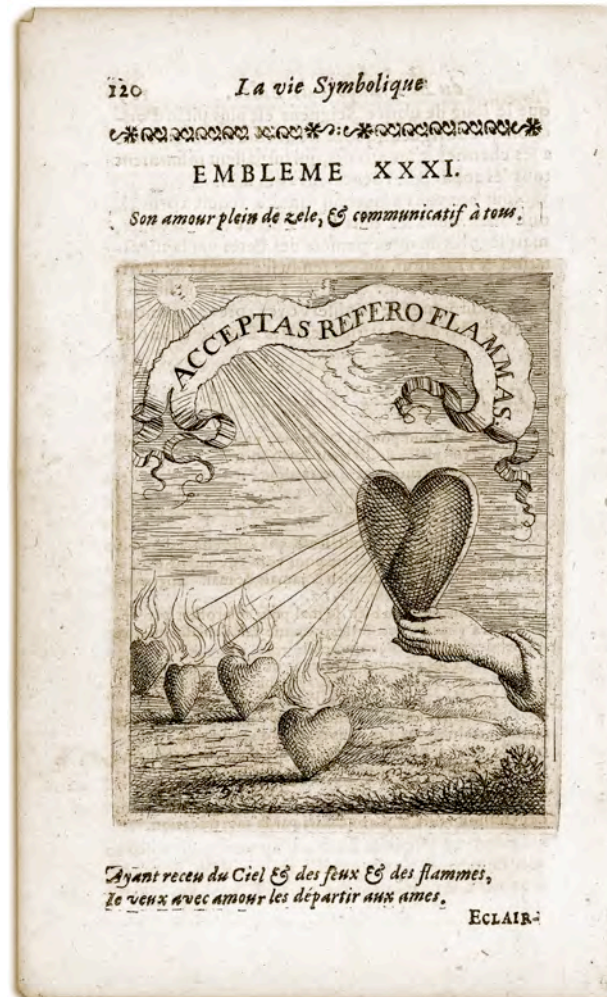
Figure 4. Albert Flamen, Emblem XXXI, in Adrien Gambart, La vie symbolique du bienheureux François de Sales, evesque et prince de Genève, comprise sous le voile de 52 emblèmes . . . (Paris, 1664).

[27] Turning now to Emblem XXXI (figure 4): Gambart adapts and reworks Francis’s verbal image of the Virgin as an unblemished mirror who reflects the rays of her divine Son’s holiness onto her spouse St. Joseph into the visual image of a concave mirror (i.e., magnifying glass) in the shape of a heart that receives the rays of the Sun of Justice and reflects them so as to kindle and enflame other hearts. The emblem’s meaning is revealed by a series of accompanying texts, which progress from the general to the specific. The motto: