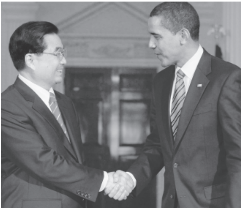
New distribution of power and responsibility in the offing: Barack Obama meets Chinese Head of State Hu Jintao at G20 Summit in London.

Unfortunately, we do have the impression that our Heads of State and economic leaders, buffeted as they are by crisis, would prefer to leave the matter to their successors rather than tackle it themselves. The crisis programmes could be a good possibility to invest in renewable energies and less energy-intensive infrastructure. Yet most of the stimulus programmes are still disappointing in this regard. For commendable exceptions we have to look to countries like South Korea with a strong tradition of industrial policies.