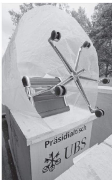
Billions down the drain – a return to «boring banking» would be in order.

The new financial market regulations now under discussion in the G20 and the UN are leaning towards «boring banking»: 1. Higher capital cover requirements and a much lower leverage ratio. 2. The inclusion of all credit transactions in the balance sheet and the prohibition of all off-balance sheet special purpose entities. 3. Making all financial companies and instruments subject to the regulatory authorities, and instituting procedures for the approval and banning of new types of financial companies and «innovative» financial products. 4. New remuneration systems free of fraudulent