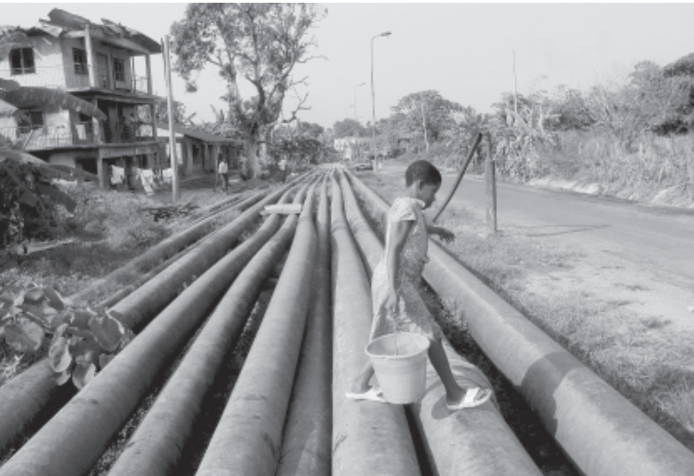
Ill-suited as climate bank: World Bank promotes oil mining and finances coal-fired power plants in many countries. In the picture: Pipeline in Nigeria.

The climate summit set for December in Copenhagen is expected to get a new world climate agreement back on the rails. Along with new CO 2 reduction obligations, one central question is how poor countries will pay for billion-dollar climate change adaptation measures, and who has the say in the funds concerned.