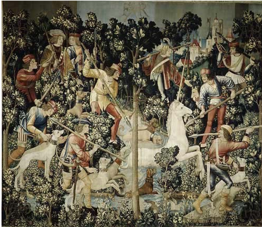
Plate 2: The Unicorn Leaps across a Stream , South Netherlands, 1495–1505 (Metropolitan Museum of Art).