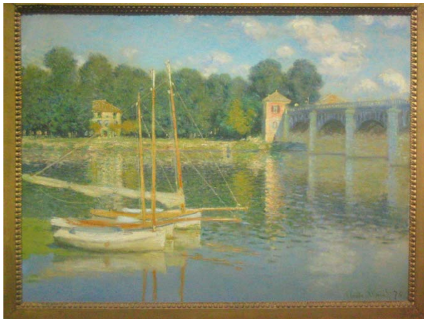
Plate 6: Claude Monet, The Argenteuil Bridge , 1874 (Musée d'Orsay).