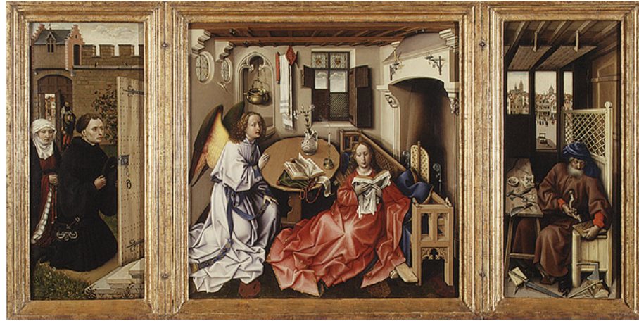
Plate 3: The Annunciation Triptych , Netherlands, ca. 1425, Robert Campin. (Metropolitan Museum of Art).