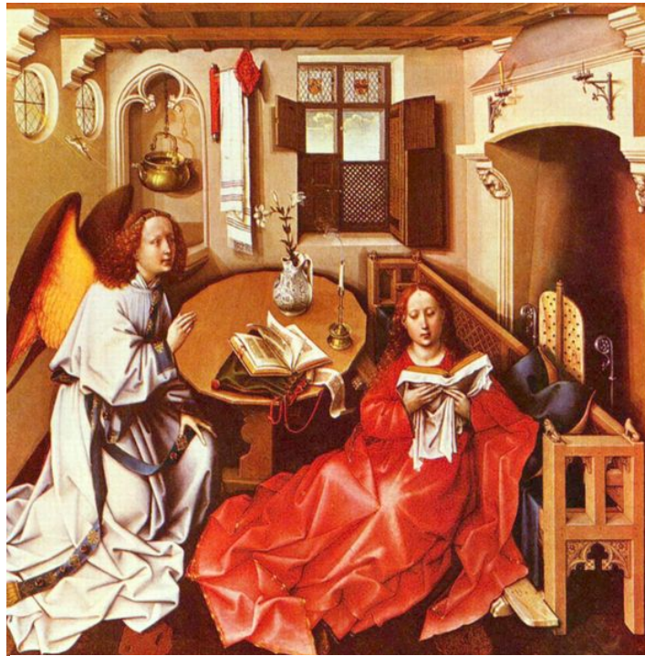
Plate 4: The Annunciation Triptych (detail).