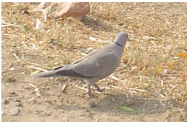
Figure 2 Collared dove.

Noteworthy is the observation that mostly animal byproducts are used in traditional health care systems without any loss to animal. The therapeutic information's is mostly based on domestic animals, but some protected