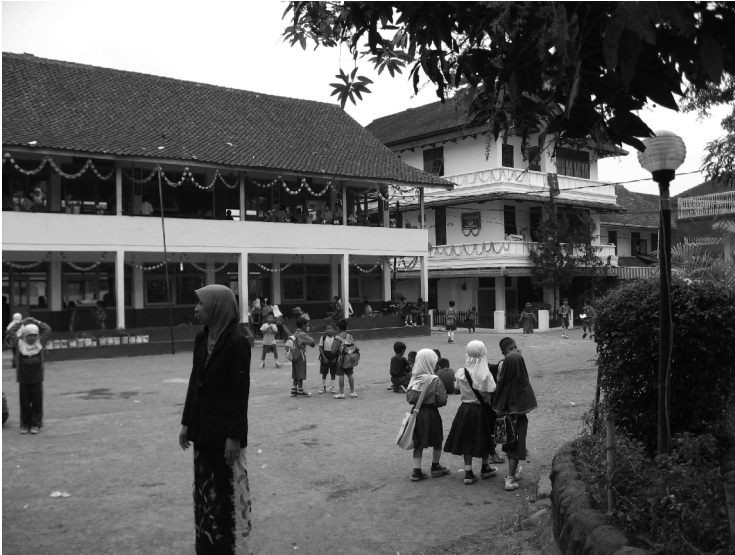
Figure 1: School yard of state elementary school next to the house of Ilyas Ruhiyat in the Cipasung Islamic School complex, Singaparna, Tasikmalaya.