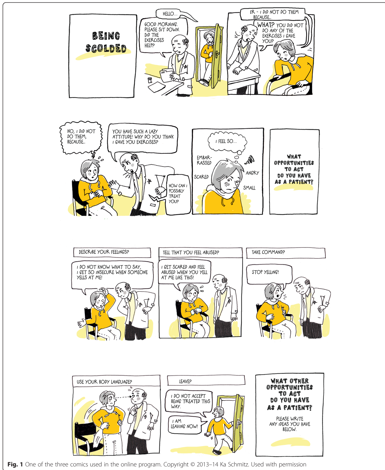
Fig. 1 One of the three comics used in the online program. Copyright © 2013–14 Ka Schmitz. Used with permission

an appropriate instrument. ISAHCQ is based on the theory of planned behaviour, which has been widely used in the study of health behaviour and behavioural