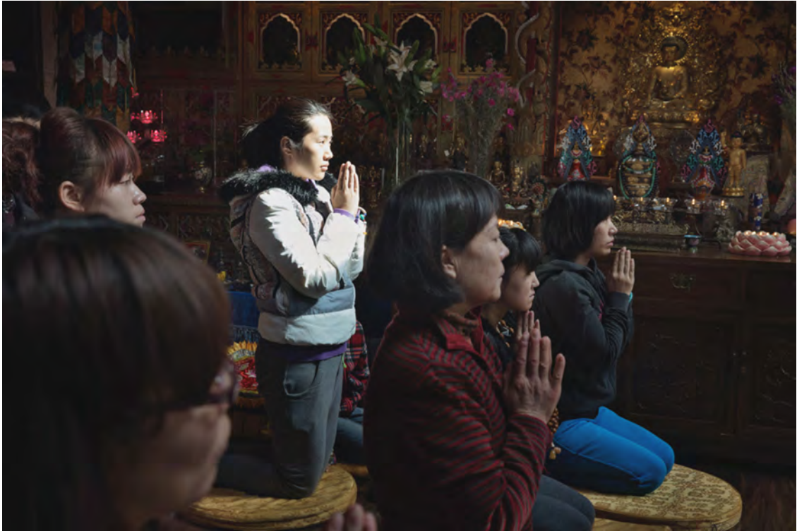
A women prayer at a private Tibetan Buddhist worship hall in the outskirts of Beijing.

In practice, this meant rehabilitating many things that previously had been attacked as superstitious. Hence rituals, and even traditional folk religious pilgrimages were redefined as cultural practices worth preserving and even subsidizing.