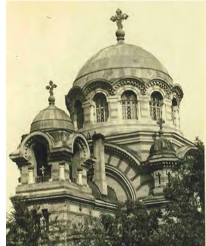
The Pokrov Church in Harbin.

For more on the Pokrov Church and on other Orthodox churches in Harbin see the contribution of Piotr Adamek in China heute 2018, No. 2, pp. 118-121 [in German].