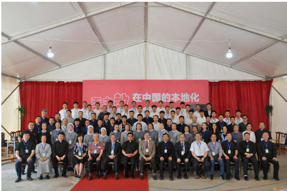
Participants of the Conference on Inculturation of Catholicism in China.

The conference was held from June 21–22, 2018 at the Seminarium Catholicum Chilinen-sis (吉林天主教神哲学院) in Jilin City of Jilin Province, organized by the Seminary and co-sponsored by Fu Jen Academia Catholica (辅仁大学天主教学术研究院) of Fu Jen Catholic University in Taipei. This was also the closing event to mark the celebration of the 30th anniversary of the seminary's re-opening (1987). Given the actual circumstances in China, that a seminary could successfully organize a conference on such a scale, with concrete co-operation crossing the boundaries of the Mainland, is something rather rare, if not entirely unparalleled. As a matter of fact, this was actually the second time that the two institutions joined forces for such an event. The first time a similarly organized con-