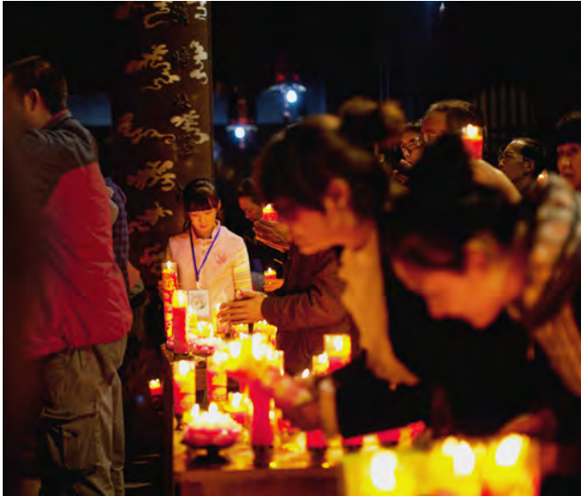
Worshippers lighting candles outside the temple to the Great Immortal Huang, during a ten-day retreat in 2012.

This doesn't include the tens or even hundreds of millions of people who practice physical cultivation like Qigong or other forms of meditative-like practices. 3