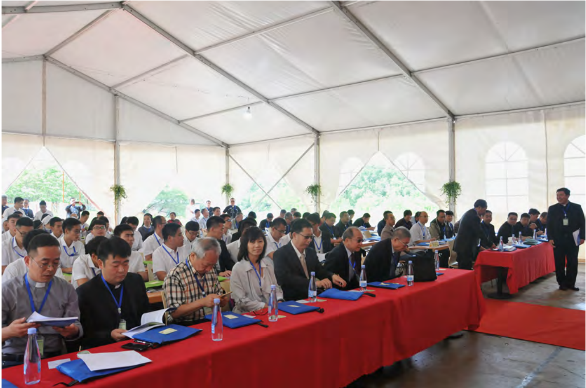
The open atmosphere in the Tent of Meeting.

the ultimate source, driving force and motivation for inculturation lies in the Incarnation of the Divine Word. The original Greek word used for this divine action is no other than eskenosen , literally meaning “to pitch a tent.” Indeed, the presence of something beautiful, sublime, harmonious in these two days was strongly felt by all flocked together under this Tent of Meeting – the Tabernacle, the Abode of the Divine.