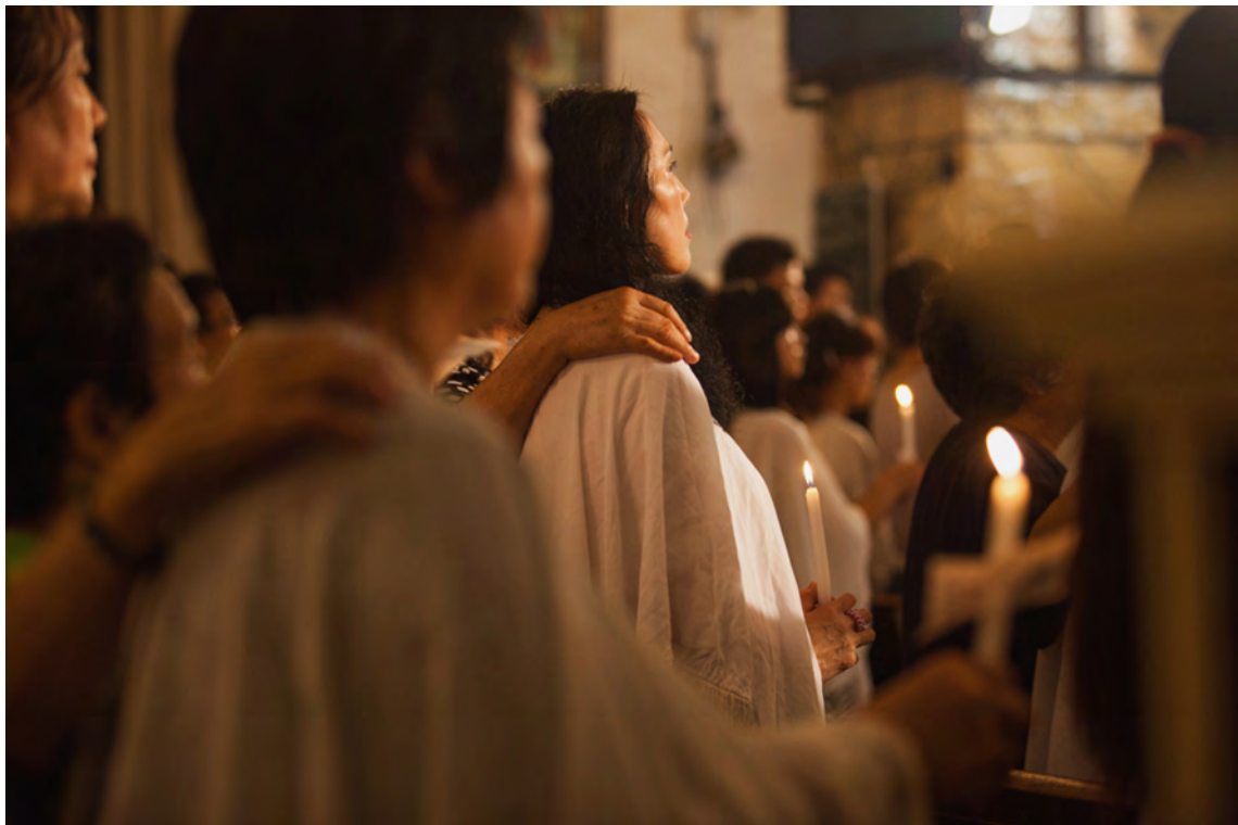
Worshippers at the Cathedral of Immaculate Conception (Xuanwumen) in Beijing.

For millennia, Chinese society was held together by the idea that laws alone cannot keep people together. Instead, philosophers like Confucius argued that society also needed shared values. Most Chinese still hold this view. For many, the answer is to engage in some form of spiritual practice: a religion, a way of life, a form of moral cultivation – things that will make their lives more meaningful and help change society.