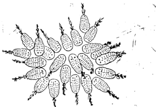
Last instar larvae of Aspidomorpha miliaris , presenting cycloalexia arrangement on under surface of a leaf of Ipomoea carnea . Exuviae carrying caudal ends of the larvae form periphery of the annular arrangement.

active, that is they are not feeding or moulting, take to round defense, which has been given the name “cycloalexia” by entomologists. The larvae form a circle, with some larvae in the middle. The larvae, in the circular arrangement, may have their heads in the periphery or, as seen in some species, their tail ends. The larvae of the Oriental tortoise beetle Aspidomorpha miliaris carry a chain of shed skins at their hind ends. The cast skins are filled with black excretory matter. In this cycloalexia species the larvae keep their caudal ends at the periphery of the arrangement (Verma, 1996). When a predator or a parasite approaches, the larvae curve their hind ends upward in threatening manner. The threatening behaviour, shown by the peripheral larvae in different cycloalexia species, includes biting movements of jaws, regurgitation of a glandular secretion through the mouth, curling the outer part of the body upward, reflex bleeding etc. In the cycloalexia arrangement of larvae of saw flies (Tenthredinidae, Hymenoptera), older larvae form the circle, with younger ones in the middle. When the latter have grown older, they will take the peripheral position. Jolivet (1991) has referred to this behaviour of the saw fly larvae as “altruism with reciprocity”.