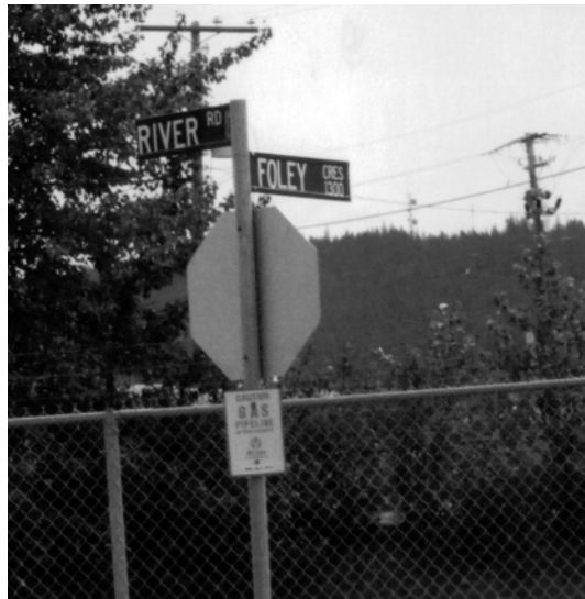
Figure 18: Corner of River Road and Foley's Crescent.

The Island Cache was removed, partly by water, and partly by political power. The memory of the community has been eroded further. It has been erased from the history created by street signs, and substituted with the much earlier, and more westerly, image of Foley and his railway. The Island Cache is not just gone, it has been replaced. There was never a street in the Island Cache called Foley Crescent. Most people