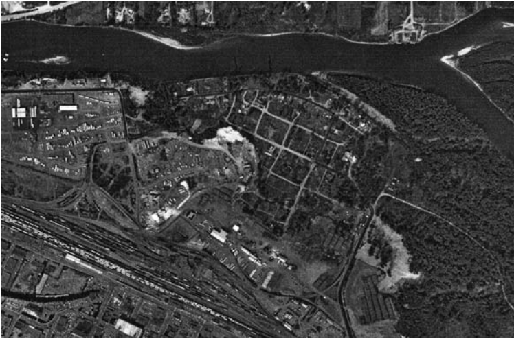
Figure 17: The Nechako Fraser Junction 1978.

Since 1972 the Island Cache has become more and more industrial as low-lying areas have been backfilled and mills have expanded. The eastern part of Cottonwood Island is now a park, and the western part a heavy industrial area (with a very few homes remaining). It is not only difficult to see where the community of the Island Cache once stood — it is a challenge to even see there was once an Island.