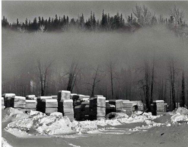
Figure 6: Air Pollution in the Cache — 1972.

the outskirts of the city at the time (see Parker 1965), the housing stock was varied, and a great deal was sub-standard. The community was a relatively poor place, filled with working class families, families on welfare, and families of the working poor. In the 1960s and 1970s, these people were mostly also either Aboriginal or the most recently arrived immigrants from Europe. Only a small proportion of the community was made up of established European Canadian immigrants — those who were “white” were mostly poor.