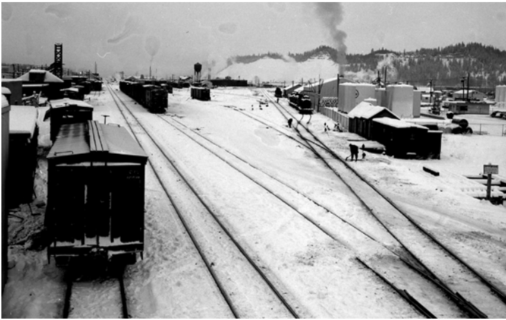
Figure 5: CNR Tracks — 1959.

From the 1910s on, the Island that eventually became the Island Cache was gradually joined to the mainland (through dyking and backfilling), but the area was not part of the City of Prince George until 1970. The area was also cut off from the city by the Grand Trunk Pacific Railway (later Canadian National Railway – CNR) tracks. The CNR land (Foley's Cache) was inside