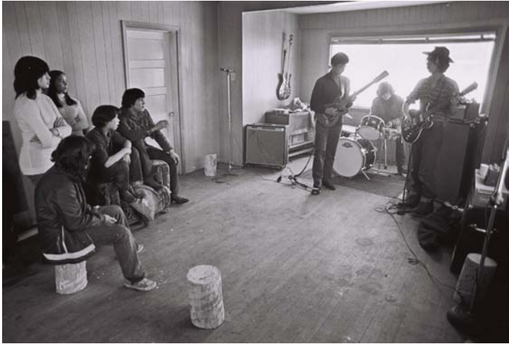
Figure 7: Youth Drop-in Centre — 1972.

of the Island Cache, and hoped to convert the entire area into heavy industry. From 1970 to 1972 there was an increasingly bitter political battle between the city and Island Cache residents, with the city manipulating planning commissions to eventually produce planning documents that flat out said the community should be razed, and the community people building up community infrastructure as best they could. The Island Residents Association