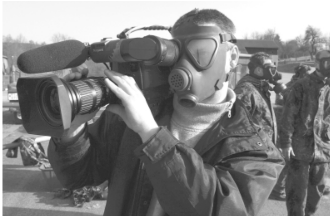
Information is the foundation of all human rights – especially vital in times of crisis.

Both Internews and IWPR have been highly commended for their involvement in the war crimes tribunals for Rwanda and the former Yugoslavia. Supporting people’s right to know and to bring the process of justice closer, daily print news coverage including broadcasting has enabled affected