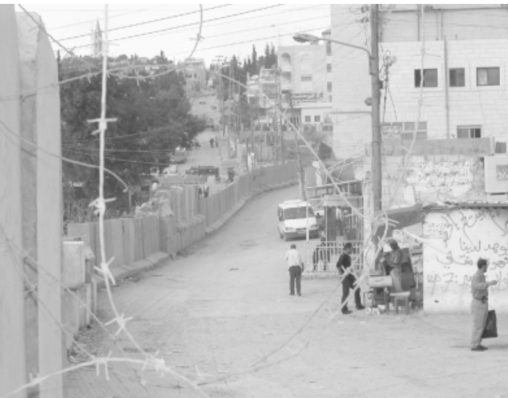
Jerusalem, a symbol of division and conflicts.