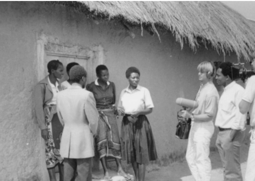
A Swedish-Tanzanian film team producing a documentary about HIV/aids in Tanzania.