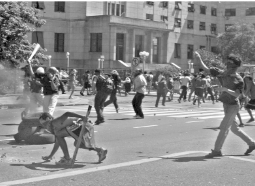
Violent protests in the capital of Buenos Aires.

cized and attracted a great deal of attention, not least because a member of the then much discussed movement in Argentina, Priests of the Third World 1 , was said to be involved in revolutionary activity. After a thorough investigation he was, however, released. In the time before the dictatorship other phenomena were also evident, which glorified the revolution and created martyrs: the death of the Colombian Catholic priest Camilo Torres in a guerilla battle in 1966, and, above all, the death of Che Guevara on 9 October 1967. The papal document about the development of the peoples, Populorum progressio , supported the poor but was also conceived as a certain legitimising of the use of violence in a deep crisis for a country. 2