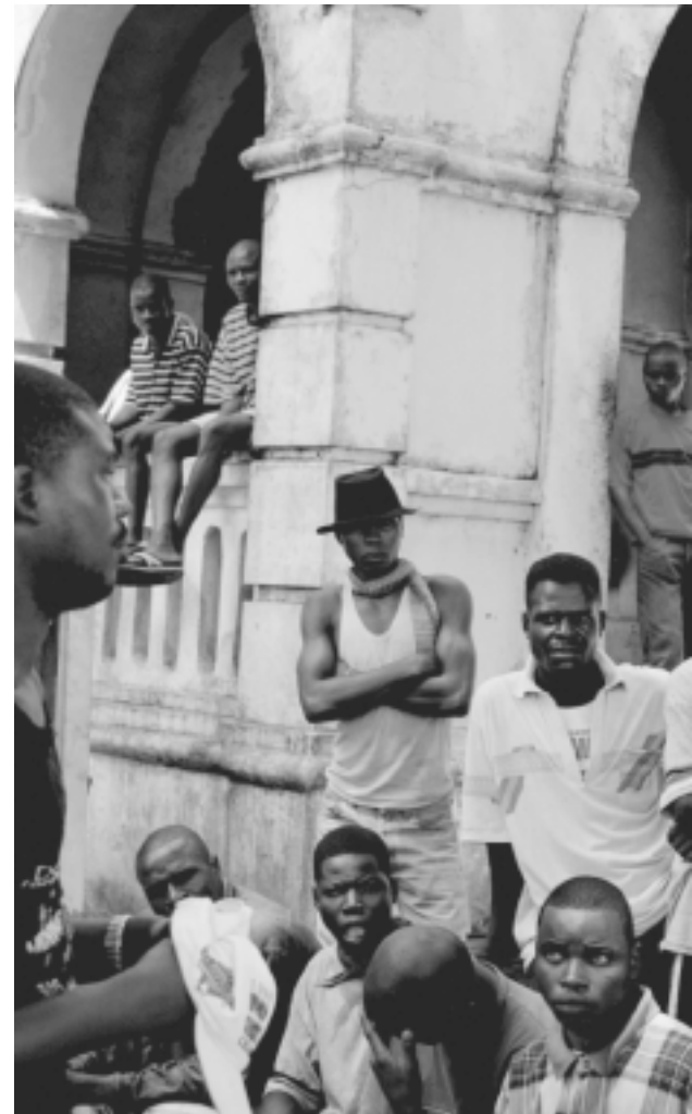
Ninjas, ex-militia in Brazzaville, and their future is part of the story to be reported in Congo.

Impunity is an enormous problem in connection with attacks on journalists. The listing of predators that are free is long. In this context, the comments from the Pentagon become worrying. The Iraq war has marked new attempts to dehumanise "them" and describe "them" as evil-makers, and reporters among the Allied forces bought that language. Sources tend to stay anonymous and