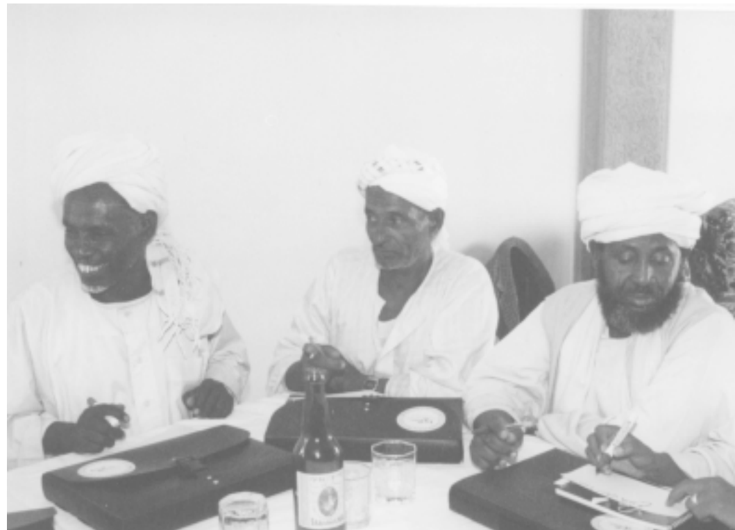
Participants came from all over Eritrea.