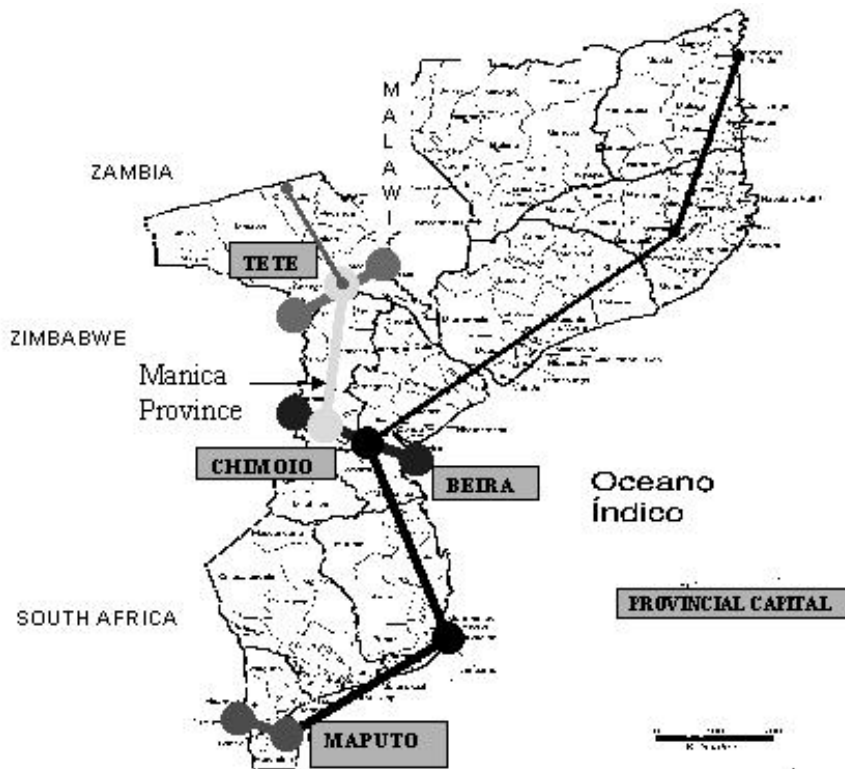
Figure 2: Road corridors in Mozambique

Source: Kwarteng and Cliff 2001. Adapted from a map produced by Ricardo Barradas, GTZ Truck Drivers' Project.