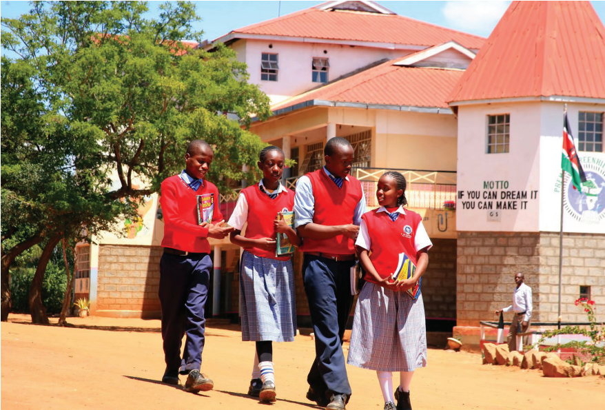
Premese Pupils chatting in front of their academic block