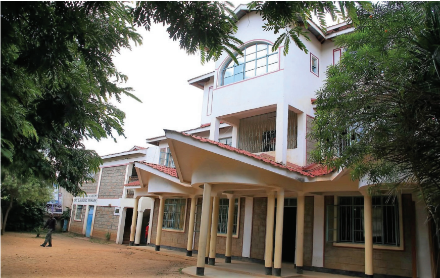
One of the Administration Blocks of Premese Schools

What does this message boil down to? It simply means if our children don't perform that well in one subject or another, we should not condemn them but instead we should take it as our homework to find out in what subjects or skills they are good at. That's why according to Albert Einstein, it has always been wrong to judge our children only by how they perform in a standard exam that doesn't necessarily recognize their different gifts and talents. He says, if we judge a fish by its inability to climb a tree like a leopard, then we will make the fish live its entire life believing it is stupid just because it can't climb a tree. Obviously that's a very wrong standard of judgment on the fish.