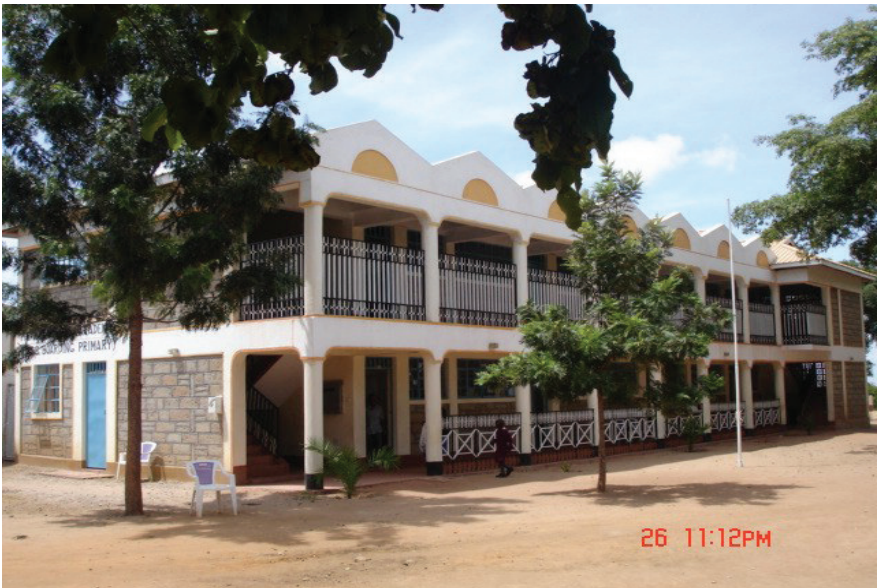
Premese School Academic Block